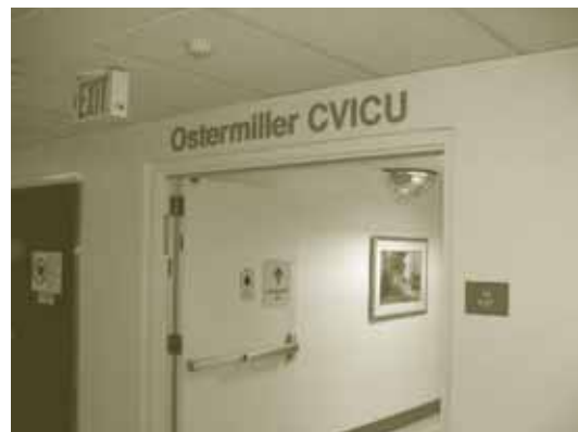
At Left: New entrance to the Ostermiller CVICU.