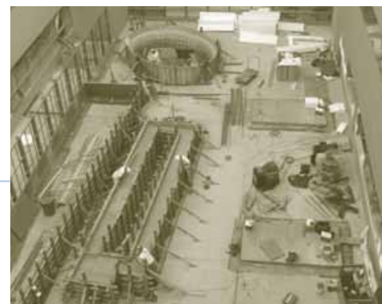
The Muth Healing Garden takes shape on the roof of the 2nd floor of the PCC. This area will provide a place of reflection for patients and visitors in the new Center.

The new Patient Care Center adds 248,000 square feet of space to the hospital's campus and will include 150 patient beds (120 now and expansion space for 20 additional beds) -- 90 percent of which will be private. There will be two-20 bed critical care units and three-30 bed medical/surgical care units. ☩