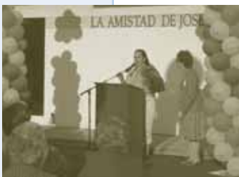
A patient expresses her gratitude for the care and services she has received from our clinics.

On this special day, both clinics opened their doors for and welcomed St. Joseph Hospital patients, employees and members of the community to tour their facilities, meet their staff, and learn about the great work they do. Grateful patients expressed their thanks for services they received at our clinics and we thanked our donors for making these services possible.