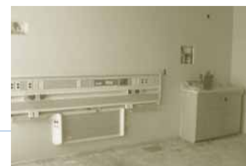
The new patient room headwall provides a comprehensive array of support for the new technologies planned.